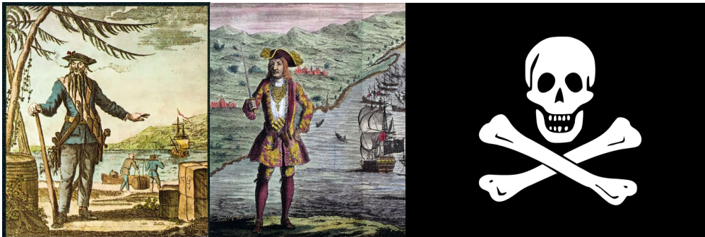
Left: Edward Teach, Middle: Bartholomew Roberts, right: Jolly Roger flag

Bartholomew was given the nickname Black Bart as he was a tough, cruel fighter. He sailed a ship called the Royal Fortune.