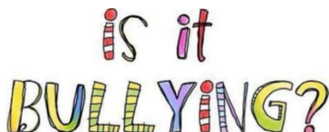
Table 1: Source - Psychology Today

When someone says or does something unintentionally hurtful and they do it once, that's RUDE.